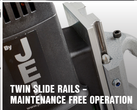
TWIN SLIDE RAILS – MAINTENANCE FREE OPERATION