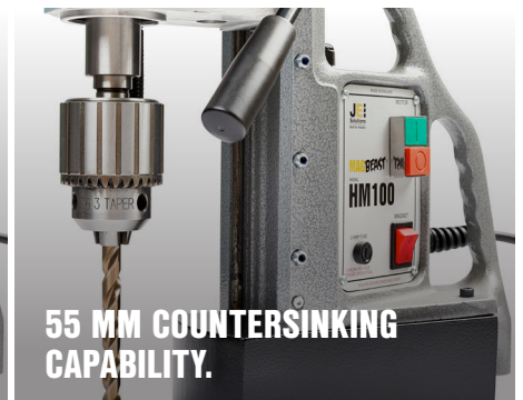
55 MM COUNTERSINKING CAPABILITY.