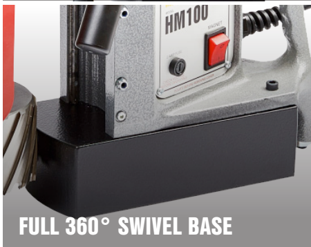
FULL 360° SWIVEL BASE

CALL 01706 229 490 TO BOOK YOUR DEMONSTRATION NOW OR VISIT WWW.JEIUK.COM