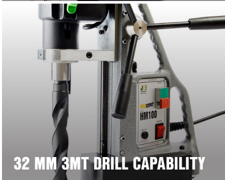
32 MM 3MT DRILL CAPABILITY