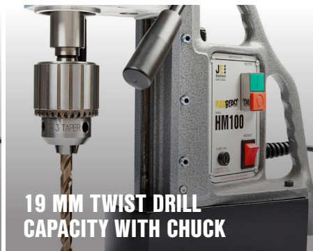
19 MM TWIST DRILL CAPACITY WITH CHUCK