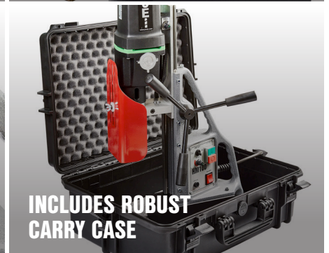
INCLUDES ROBUST CARRY CASE